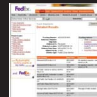
Track Your Order