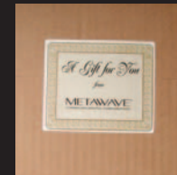
Custom Gift Labels