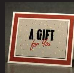
"A Gift for You" Card