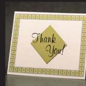
"Thank You" Card