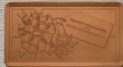
Bow With Gift Card