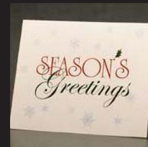
"Season's Greetings" Card